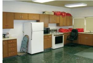
Upgrade Rombout Home & Career Suite