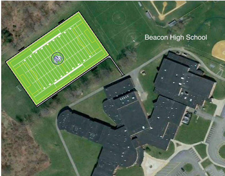
Beacon High School