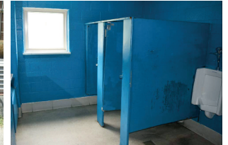
Bathroom Accessibility Updates & Repairs