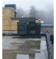
Air Handler Replacements

Preliminary concepts and images. Final project may vary.