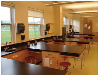
Proposed State-of-the-Art Science Wing at Rombout Middle School

Preliminary concepts and images. Final project may vary.