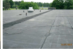
Roof Replacements & Repairs