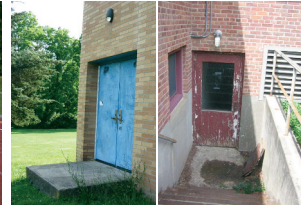
Exterior Door Replacements