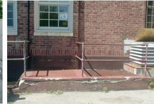
Exterior Masonry & Flashing Repairs