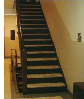
Add Handicap Handrails